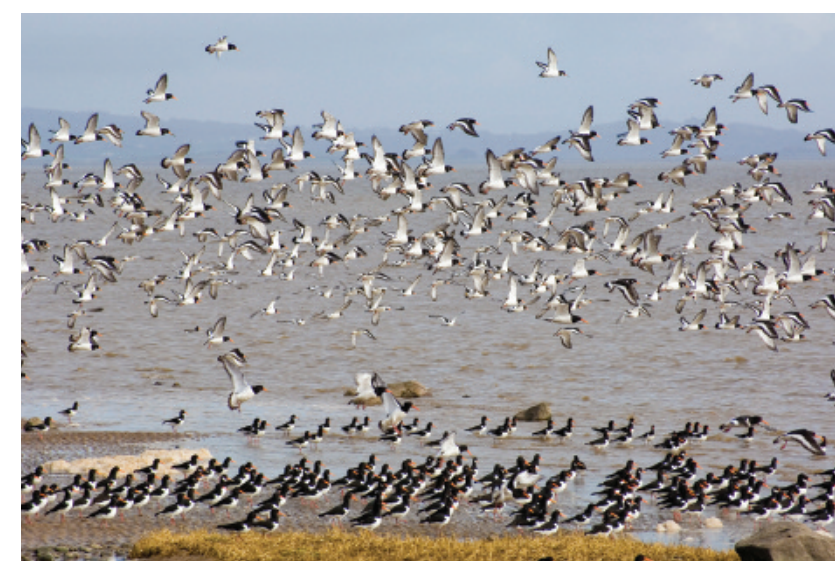
Oystercatchers, near Aldingham