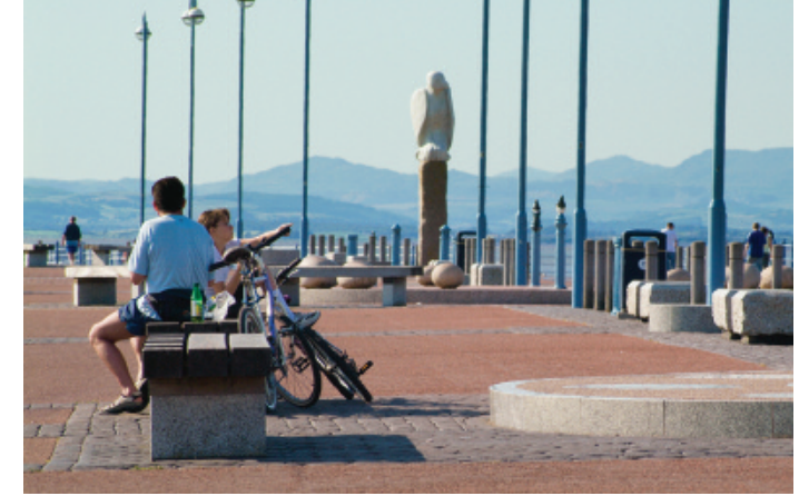
The Stone Jetty

Halsgrove House, Ryelands Industrial Estate, Bagley Road, Wellington, Somerset TA21 9PZ Tel: 01823 653777 Fax: 01823 216796 www.halsgrove.com e-mail: sales@halsgrove.com