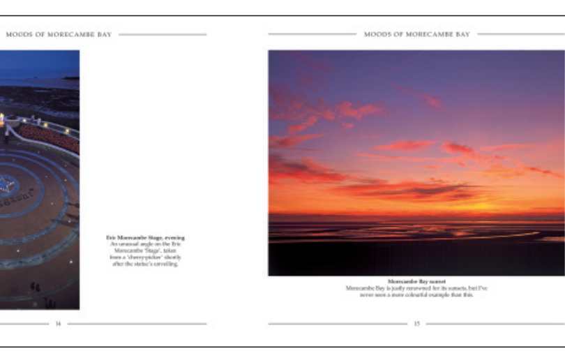
Example of a double page spread.