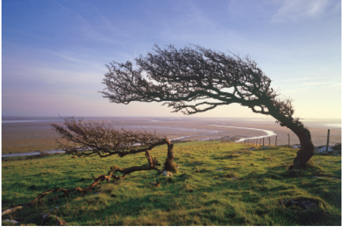
Above: Morecambe Bay from Humphrey Head